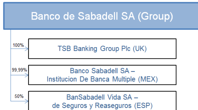
Chart 1: Main subsidiaries and investments of Sabadell

The main subsidiaries and investments of Sabadell can be found in the following chart: